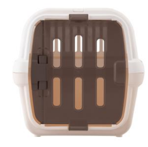
Clear front doors for easy access!