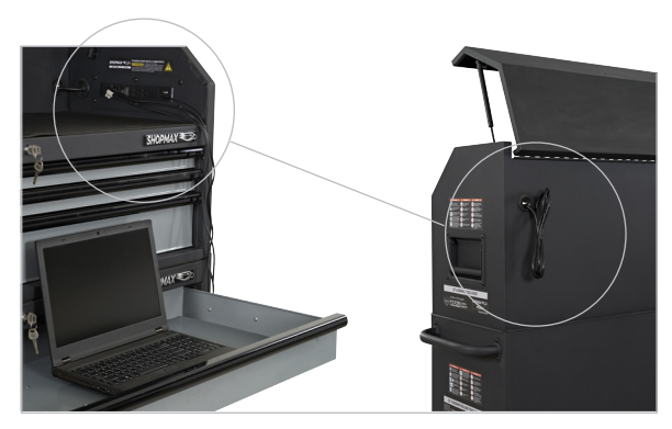
Four grounded outlets and two USB ports included