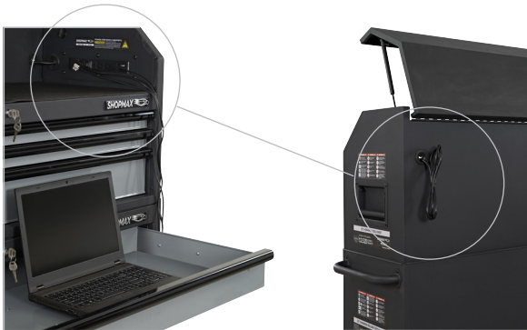
Four grounded outlets and two USB ports included