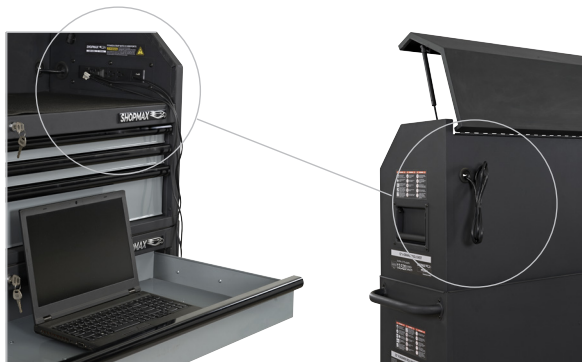
Four grounded outlets and two USB ports included