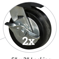
5" x 2" Locking swivel casters