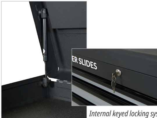
Internal keyed locking system