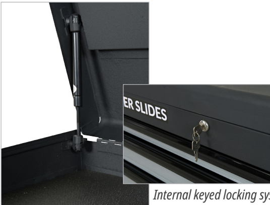
Internal keyed locking system