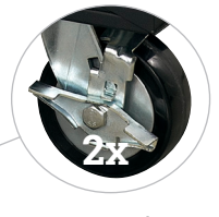
5" x 2" Locking swivel casters