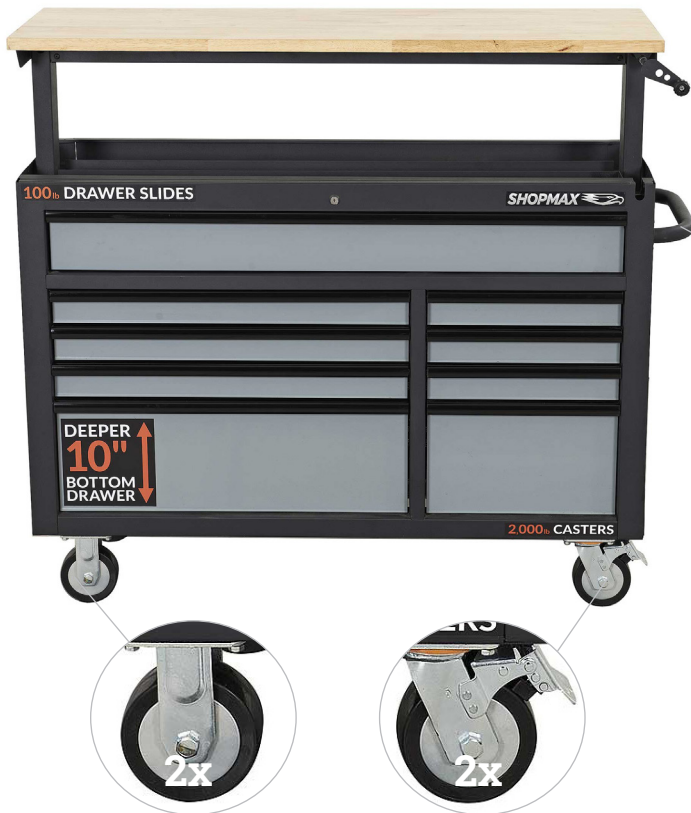
5" x 2" Heavy-duty casters