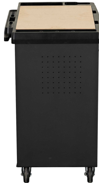
Pegboard-perforated side panel for hanging even more tools