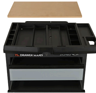
Removable top work surface, revealing more storage

If you're looking for organizing and being able to efficiently store your hand tools and other work items, you've got the right workstation. The fiberboard (MDF) top work surface is durable and never warps. Remove the top to reveal the tray compartments, where you can keep everything at your fingertips while working on your current project.