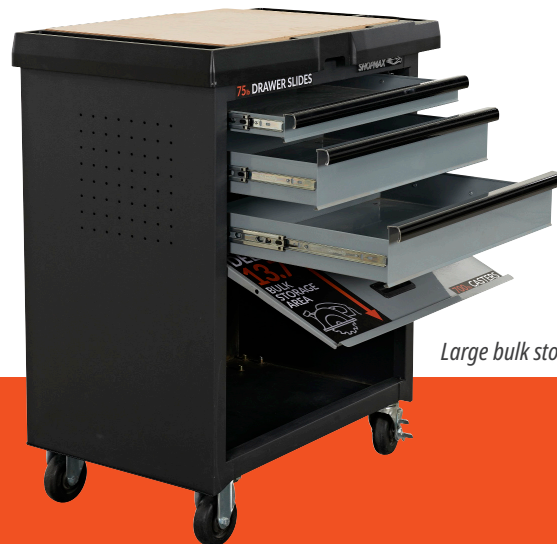
Large bulk storage area