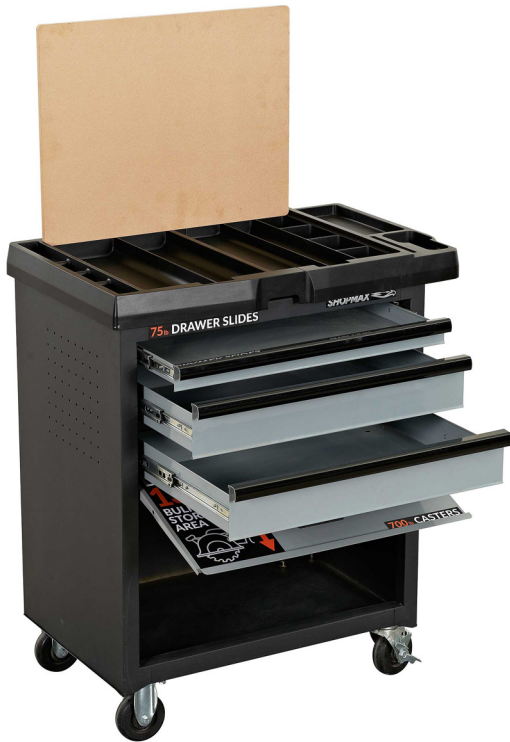
Stow the work surface while grabbing your hand tools