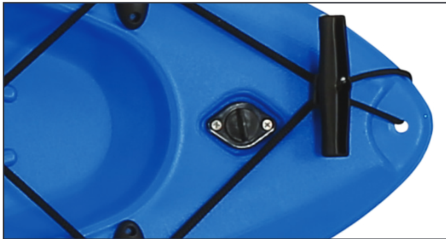
Drain Plug Location