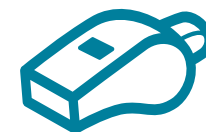
Sound-Signaling Device (whistle)