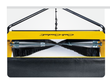
Extra-wide 9 in. chute allows material to flow through without clogging