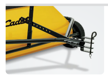
3-position hitch allows use with all lawn tractors