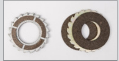
PATENTED FUSED BRAKE SYSTEM