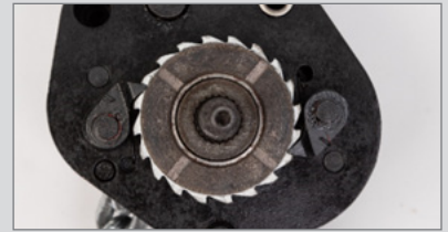
DUAL-PAWL RATCHET DRIVE TO SPLIT LOAD