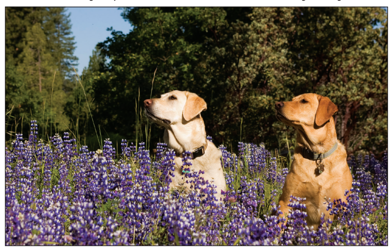
Labradors in a lavender field

This can be applied daily as needed to the dog's coat. Avoid the mouth and eyes. As this product is for external use only, it is recommended for dogs only and is not suitable for cats due to their self-grooming behavior.