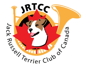
The Jack Russel Terrier Club of Canada (since 2012)