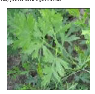
Devil's Claw Root