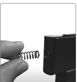
Insert the spring into the hole.