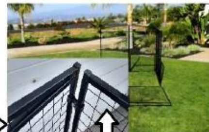
End panel Side panel

Repeat step 2 with the opposite end and side panels. Make sure the end panels are on the outside .