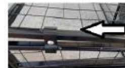
Wire cut out

Clamp roof panels together wherever the wire is cut out. Keep the roof and run square/even around the edges.