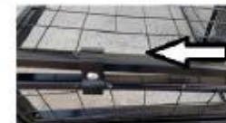
Wire cut out

Clamp roof panels together wherever the wire is cut out. Keep the roof and run square/even around the edges.