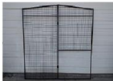
Coop end/adaptor end panel