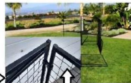
End panel Side panel

Repeat step 2 with the opposite end and side panels. Make sure the end panels are on the outside .