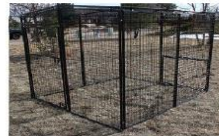
7'6" Run Pictured