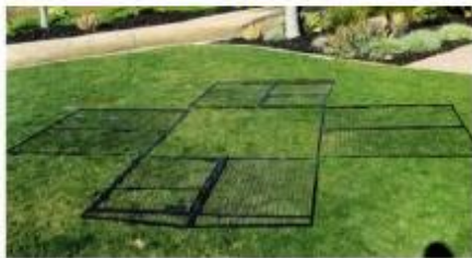
7'6" Run Pictured

Lay out front, back and Side panels. The 15' Chicken run works The same way. Lay out All components.