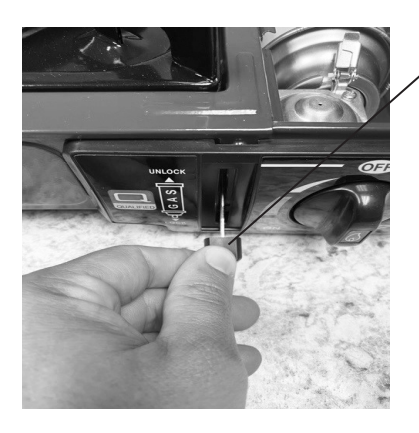
Cylinder Fix Lever Fuel Lock Position

Push down the cylinder fix lever located on the front face of the stove to the FUEL LOCK position. If cylinder fix lever does not easily go down DO NOT FORCE! Re-position cylinder until cylinder fix lever can easily be pushed down into the LOCK position.