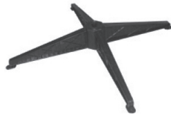
STEP 2 (Figure C)