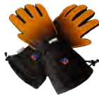
EPIC Heated Ski Gloves