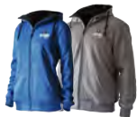
RIDGE Heated Hoodie