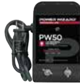
PW50 110 VOLT PLUG-IN

207FT/63M Electric Fence Wire Part No. GSX -2