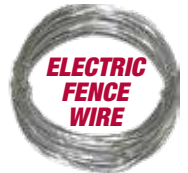
ELECTRIC FENCE WIRE