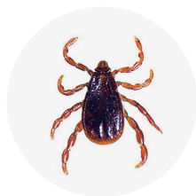
Brown Dog Tick

Spreads: Lyme Disease, Babesiosis, Anaplasmosis