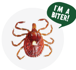
Lone Star Tick

Spreads: Rocky Mountain Spotted Fever, Ehrlichia, Babesiosis