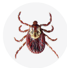
American Dog Tick

Spreads: Ehrlichia, Rocky Mountain Spotted Fever