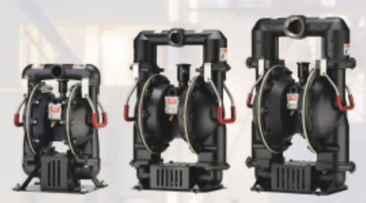
Available in 1-1/2", 2" and 3" port sizes.

ARO air-operated pumps have been utilized in the mining industry for decades. Their rugged reliability, stall-free operation and convenient portability have made them a fluid handling favorite in every phase of mining operations. These include mud and muck pumping, dewatering, drift dewatering, fuel-transfer, lubrication and more. As part of worldwide Ingersoll Rand, ARO has the expertise, the technologies, the resources and the performance that is legendary. If your mining operation has a pumping challenge that your current pumps are struggling with...maybe its time you tried a legend: ARO.