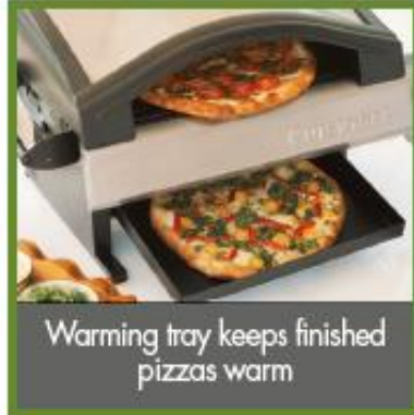
Warming tray keeps finished pizzas warm