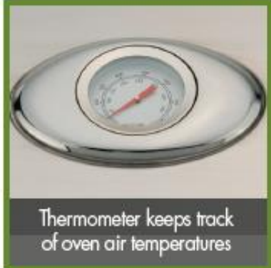
Thermometer keeps track of oven air temperatures