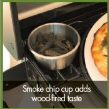
Smoke chip cup adds wood-fired taste