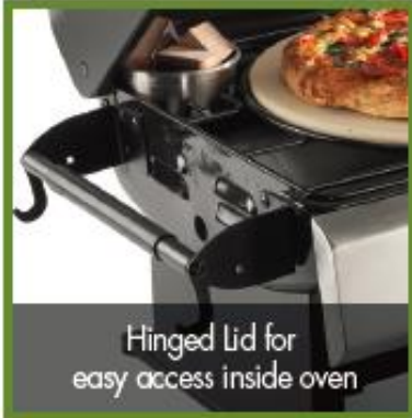
Hinged Lid for easy access inside oven