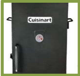
Handles included on both sides