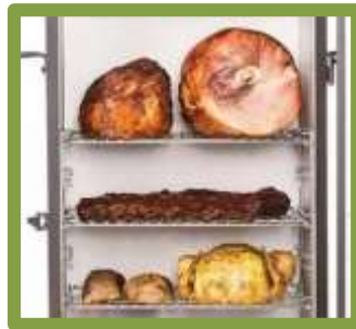
548 sq. in. of cooking space