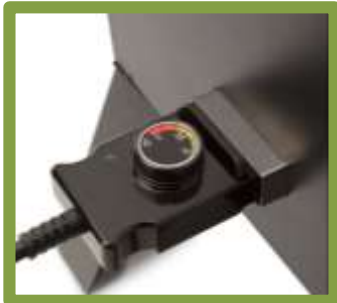
1500-watt heating element will produce a temperature from 100°F to 400°F