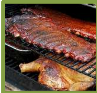
Multi-purpose- can cook different types of meals