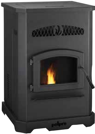
With optional hopper extension