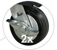
5" x 2" Locking swivel casters