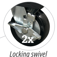
Locking swivel casters