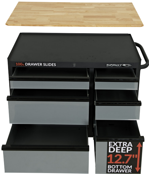
Removable wood top work surface