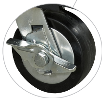
5" x 2" heavy-duty casters, two static and two swivel/locking