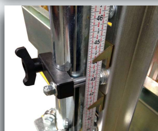
Dual Rip Pointers