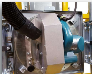
Makita Saw on Spinning Insert