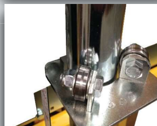
Sealed Steel Roller Bearings