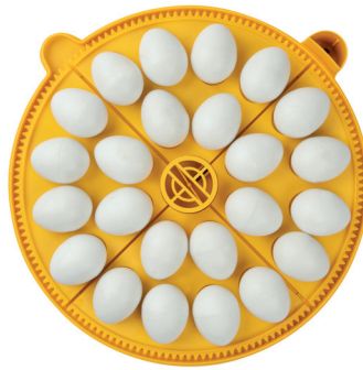
Ideal for 24 hens' eggs