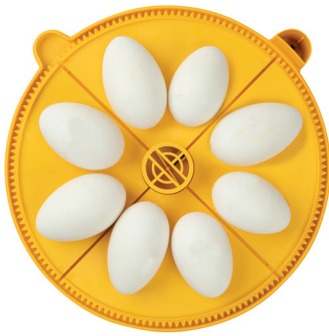
For large eggs, such as goose