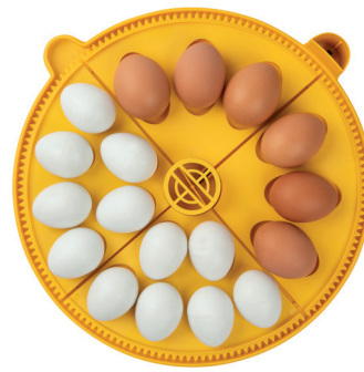
Quadrants of different sizes can be used

The egg quadrants come in four variants for different sized eggs; quail, hen, duck and goose. The Maxi 24 Advance comes with the hen and duck quadrants supplied as standard, the Maxi 24 EX has the quail, hen, duck and goose quadrants supplied. These quadrants simply clip together and can be mixed and matched to allow the user to incubate eggs of different sizes.