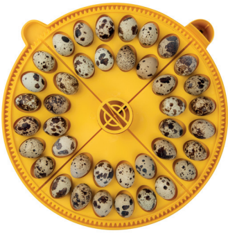
For small eggs, such as quail