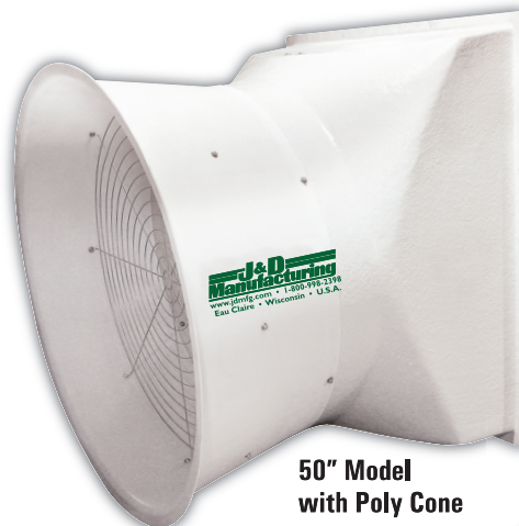
50" Model with Poly Cone