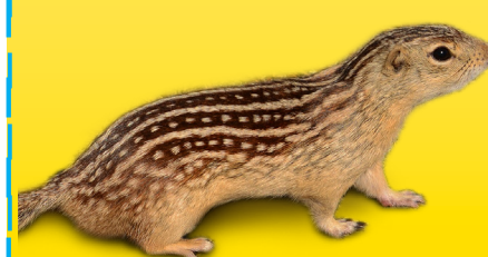
Thirteen Lined Ground Squirrels