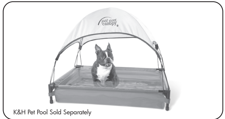
K&H Pet Pool Sold Separately

You can now fill your K&H Pet Pool with water! Your pets will enjoy many hours of fun in the sun and water for years to come!