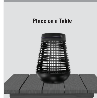
Place on a Table