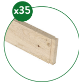
4 ft. x 3.5 in. Boards