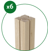
11 in. x 2.5 in. x 2.5 in. Tall Posts