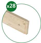
x28 4ft. x 3.5 in. Boards