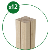
x12 8in. x 2.5in. x 2.5in. Short Posts