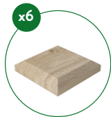
x6 Decorative Caps