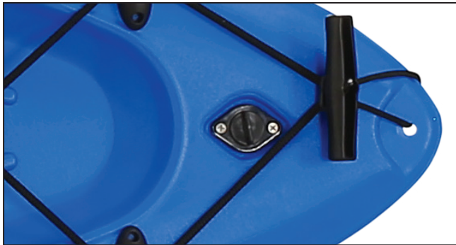
Drain Plug Location