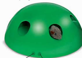
Power Button Sound Button

Place base unit on designated flat surface. Press the power button, and your Pop N Play ™ is ready for use. Press the sound button for optional chirping sounds.