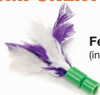
Feather Toy (installed)