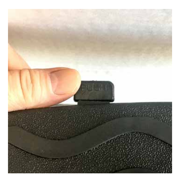
To close / fold the step stool, push the locking mechanism located at the back of the top step.