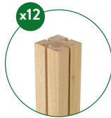
17in. x 2.5in. x 2.5in. Extra Tall Posts