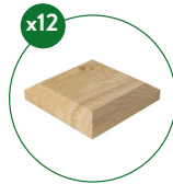
3.5in. x 3.5in. Decorative Caps