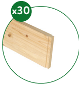
4ft. x 5.5in. Boards