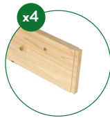
4ft. x 5.5 in. Boards