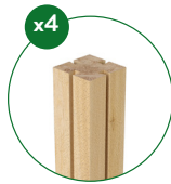
12in. x 2.5in. x 2.5in. Tall Posts