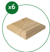
3.5in. x 3.5in. Decorative Caps