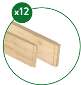
Side Walls (6) long (6) short