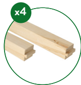
Floor Support Blocks (2) long (2) short