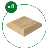
3.5 in. x 3.5 in. Decorative Caps