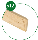
4 ft. x 3.5 in. Boards