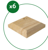
x6 3.5in. x 3.5in. Decorative Caps