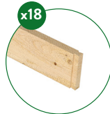
x18 4ft. x 3.5in. Boards