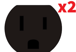
Two 120V Outlets