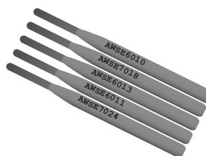
Compatible with rods 1/3" - 3/8"