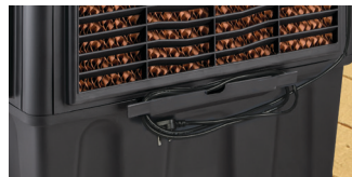
Long Electrical Cord and Storage