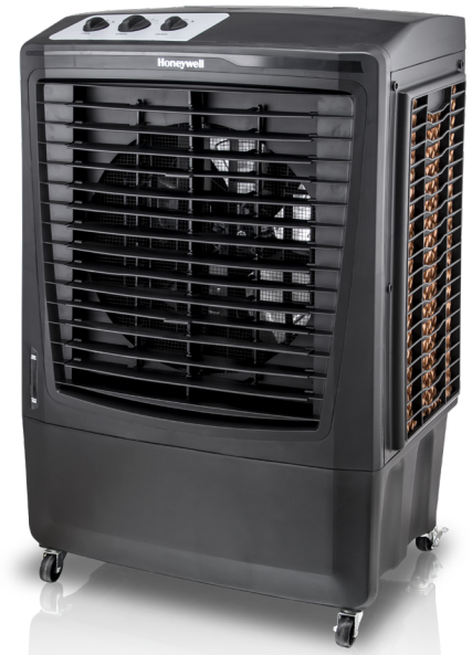
Product Dimensions (in): 27.7 (W) x 18.0 (D) x 41.2 (H) Net Weight: 41.8 lbs

Its powerful motor and wide fan blades help to deliver strong air flow. A continuous water supply connection, 14 G* water tank, and built-in overflow protection system allow longer periods of operation, making it suitable for more demanding applications.