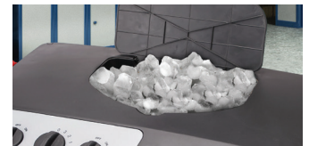
Top Loading Ice Compartment for Faster Cooling