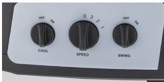
Mechanical Knob Control