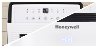
Versatile Digital Control with Mirage Display