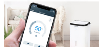
Amazon Alexa Voice Control