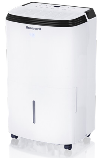
Product Dimensions (in): 13.2 (W) 10.5 (D) 20.1 (H) Net Weight: 32.78 lbs

What's more? The Washable Dust Filter helps reduce dust in the air, and is easily cleaned under a faucet - No replacement filters required.