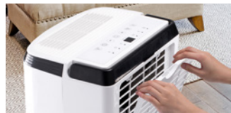
Washable Dust Filter and Filter Clean Alert