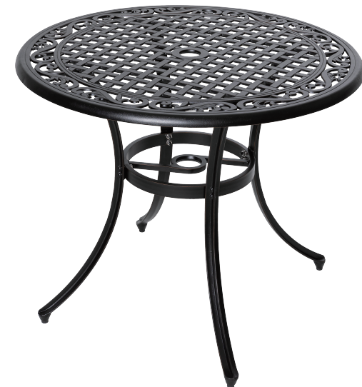
Cast Aluminum Round Dining Table CT002A SKU:CT002A