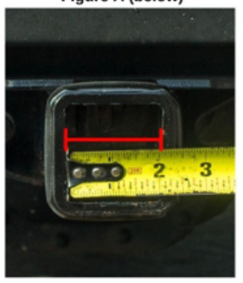
Figure A (below)

To find out which BulletProof Hitch™ will work best for your vehicle, please follow the steps below: