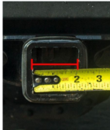
Figure A (below)

To find out which BulletProof Hitch™ will work best for your vehicle, please follow the steps below: